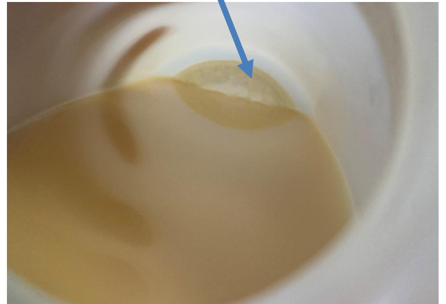
Clear thick layer adhering over sediment