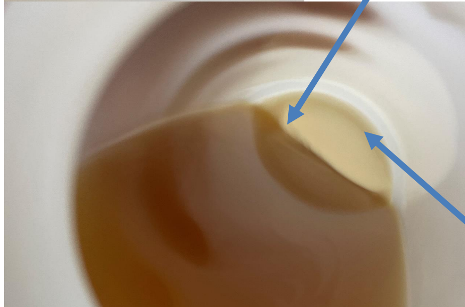
Clear Gel Tailing