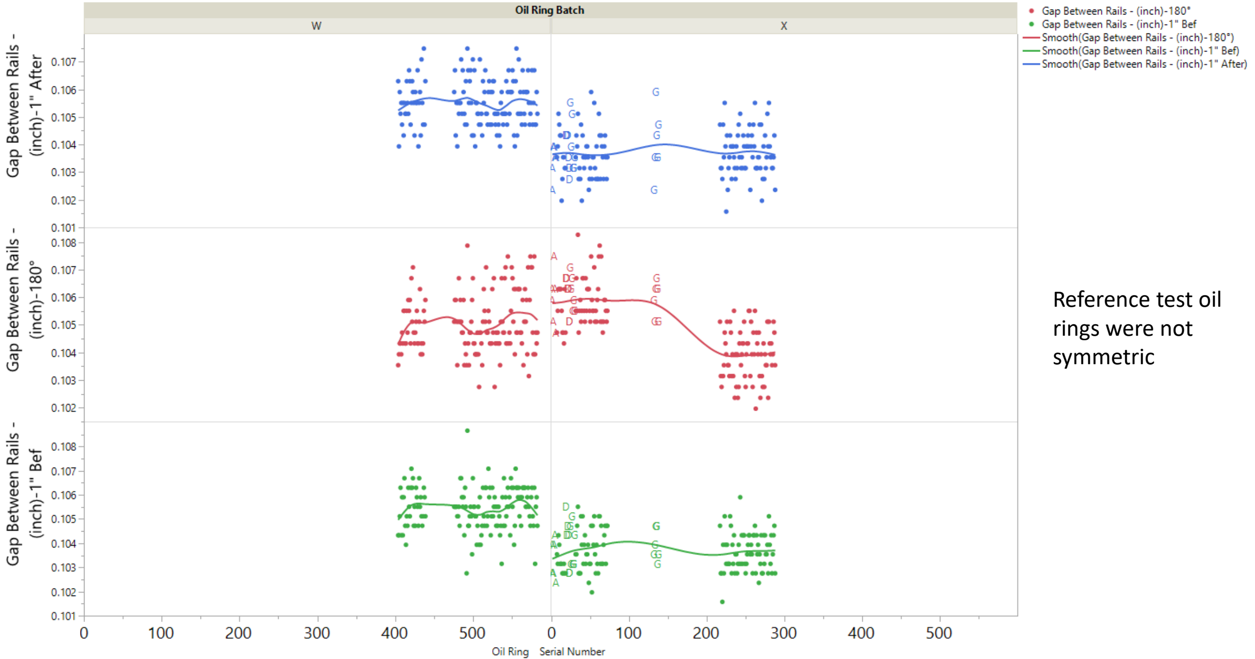
Gap Between Rails - (inch)-1" Bef & 2 more vs. Oil Ring Serial Number

Reference test oil rings were not symmetric