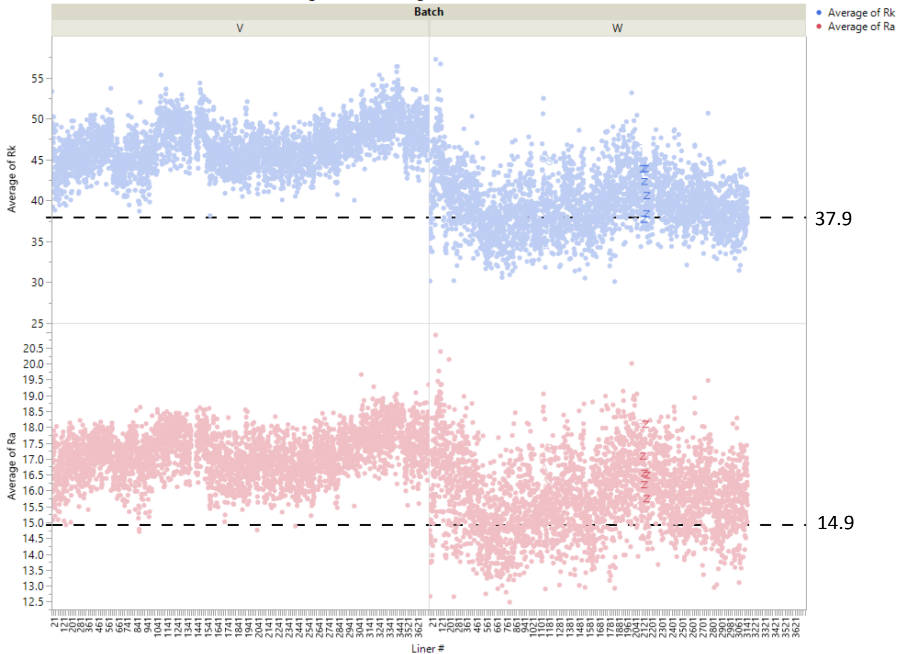
Average of Rk & Average of Ra vs. Liner #